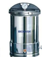
Anti-dry out type