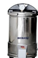
Timing control type