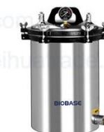
Dual fuel type