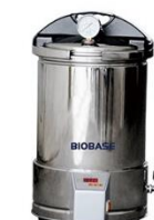
Timing control type