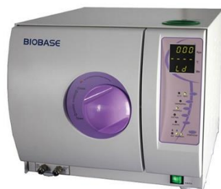
Table Top Dental Sterilizer