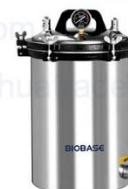
Dual fuel type