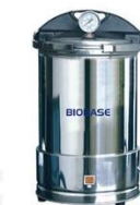
Anti-dry out type